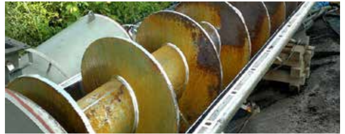
Damaged screw conveyor

As well as exhibiting abrasion resistance comparable to basalt, Belzona 1813 is also resistant to a wide range of chemicals.