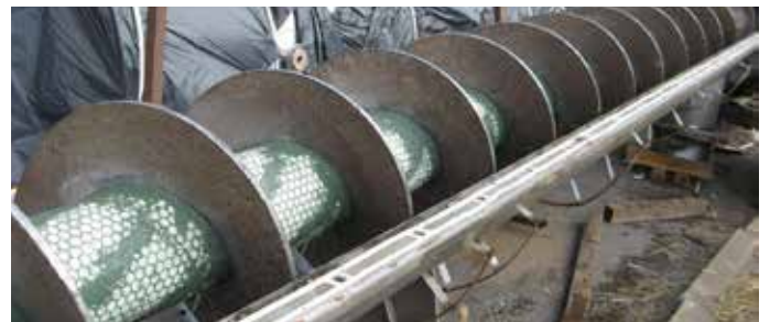
The screw conveyor repaired with Belzona 1813 and alumina tiles